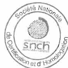
Gilles AST expert technique