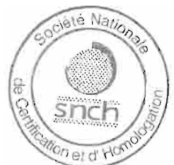
Gilles AST expert technique