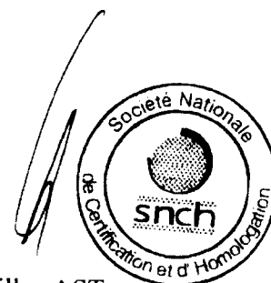
Gilles AST expert technique