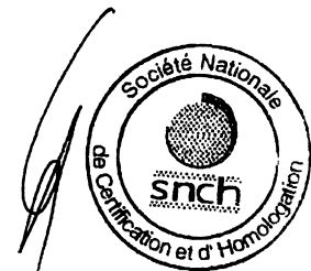
Gilles AST expert technique