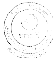
Gilles AST expert technique