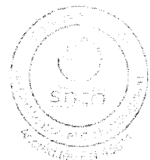
Gilles AST expert technique