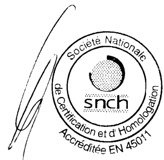
Gilles AST expert technique