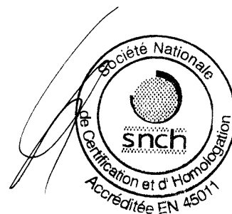
Gilles AST Expert technique