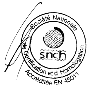
Gilles AST Expert technique