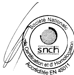
Gilles AST Expert technique