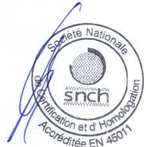
Gilles AST expert technique