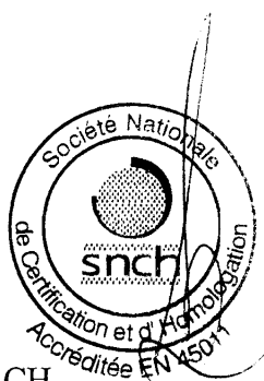
Claude LIESCH Conseiller de direction