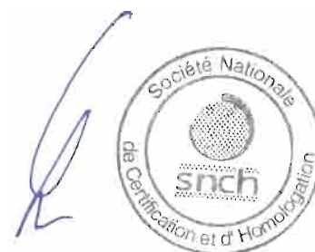
Gilles AST expert technique