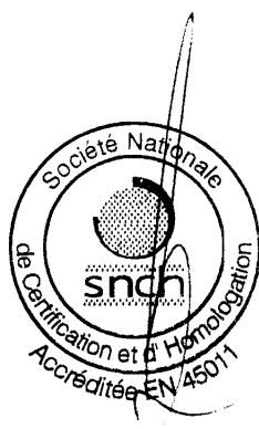
Claude LIESCH Conseiller de direction